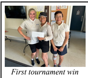
First tournament win