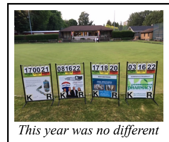
This year was no different

It was the second consecutive year that a Kerrisdale entry has gone winless at home in the top-10 format that plays a singles, pairs, triples and fours game against an opposing lawn bowls club.