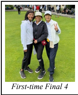
First-time Final 4