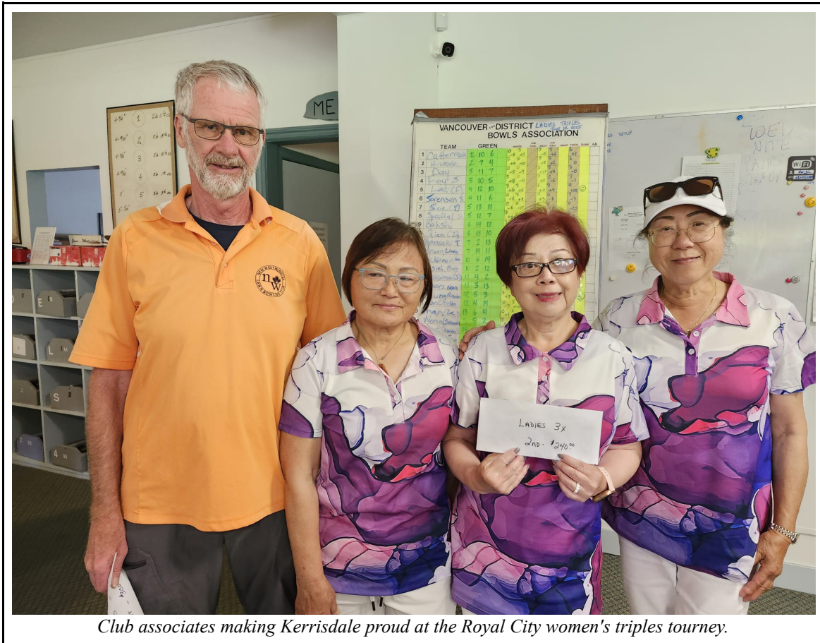
Club associates making Kerrisdale proud at the Royal City women's triples tourney.

The Kerrisdale Lawn Bowling Club is home to a very special group of associate members.