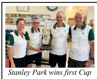
Stanley Park wins first Cup

It was good to see some new club bowlers stepping up and again putting their best foot forward for Kerrisdale at the recent President's Cup tournament at Granville Park LBC on June 11.