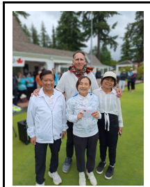
Third at Roses

A husband and wife Kerrisdale club team tied for third place at the Rose Garden Mixed Fours tournament in Coquitlam on June 22.