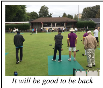
It will be good to be back

In less than a week, the Elm Park club will be opening up its green to another season of bowls in the rich, 110-year history of lawn bowling in Kerrisdale.