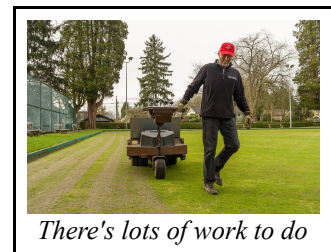
There's lots of work to do