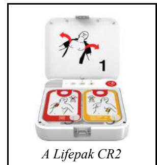
A Lifepak CR2

An AED is used to help those experiencing sudden cardiac arrest. It's a sophisticated, yet easy-to-use, medical device that can analyze the heart's rhythm and, if necessary, deliver an electrical shock, or defibrillation, to help the heart re-establish an effective rhythm.