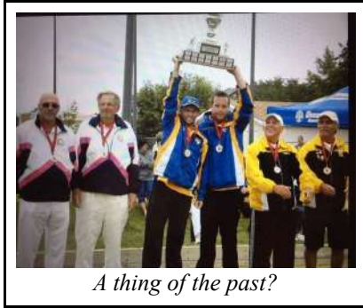
A thing of the past?

Bowls BC has announced the dates for its 2024 championship season but that will not include an invitation for the winners to participate at the national championship level.