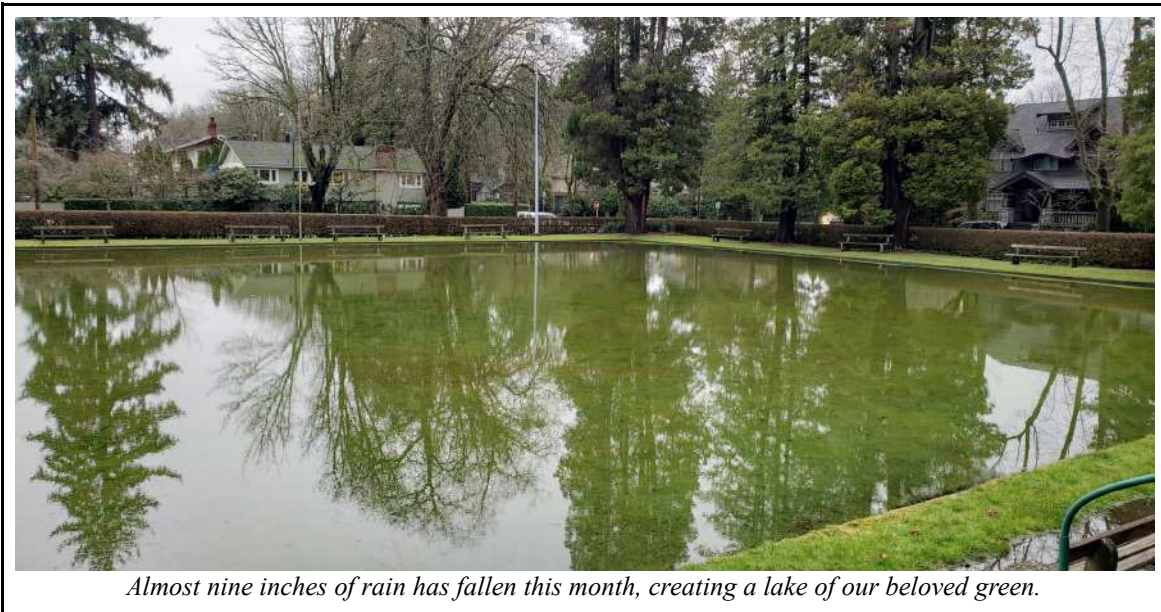
Almost nine inches of rain has fallen this month, creating a lake of our beloved green.