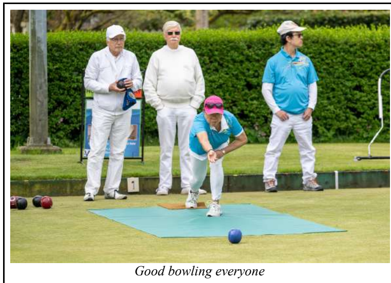
Good bowling everyone