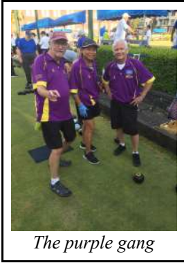
The purple gang