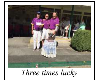
Three times lucky