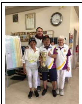
Our cup runneth over

We all knew Kerrisdale had a pretty good executive. Now we have a handsome trophy to confirm it.