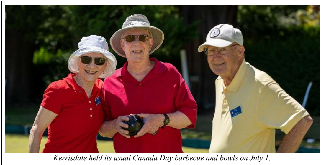
Kerrisdale held its usual Canada Day barbecue and bowls on July 1.

After dispatching both Vancouver and Dunbar in the morning 10-end games, Kerrisdale upset previously undefeated North Vancouver by nine points to secure the club's second-ever President's Cup win.