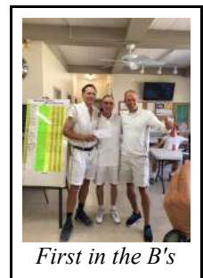
First in the B's

Berridge and Goddard also placed third overall in the B group of the men's BC Week pairs, which commenced on July 10, with a 2-0-2 result on the second day of the week-long competition.