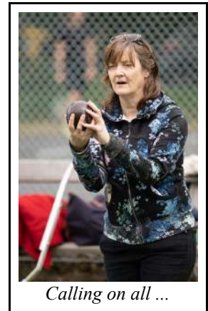
Calling on all ...

All new bowlers are encouraged to come out and test their new-found skills against club peers in a friendly and non-judgemental atmosphere.