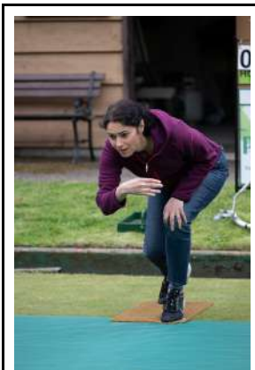
... new club bowlers

Two games, with the first bowler to 15 points, get started this Friday night (Aug. 19) at 7 pm. A tournament draw will take place on the day of at 6:45 pm. Registration cost is a $5.