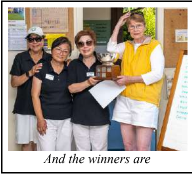
And the winners are

There was more than just hosting at this year's Norine Armstrong women's triples.