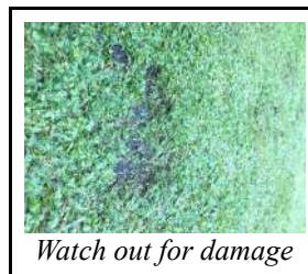
Watch out for damage

Once the top layer of grass is scalped, natural repair takes time and indentations to the surface of the green remain long after, making the