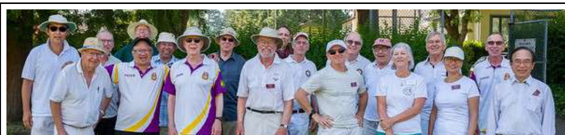
Kerrisdale and Dunbar met again for another installment of the Whisky Bowl.