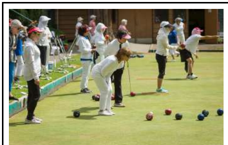
Norine would be proud

First on the agenda is the popular Diamond Doubles, an open two-day mixed pairs competition that will be held on June 29 and 30.