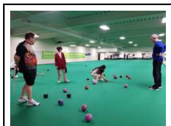
The only one of its kind

PIBC will be hosting three bowls tournaments in April to close out the indoor season.