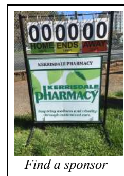
Find a sponsor