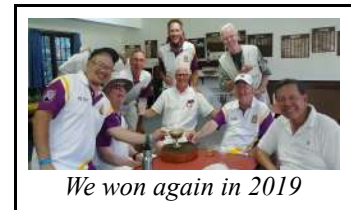
We won again in 2019

In case you are wondering, Kerrisdale has dominated the rivalry over the years and is the current holder of the vessel, retaining the bowl the last time the two clubs met in 2019.