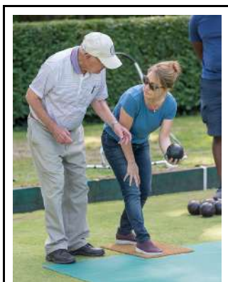
Passing on the knowledge

Not everyone is cut out to be a club president, or a treasurer, but there are many other ways to contribute to the seamlessly smooth running at Kerrisdale.