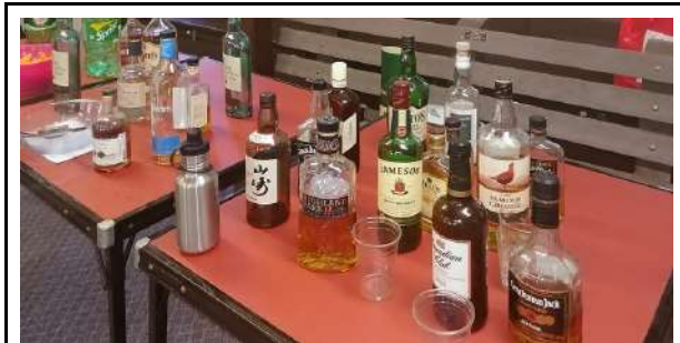
What would you expect at the Whiskey Bowl?

There will be a lot going on at the Kerrisdale bowls club this season.