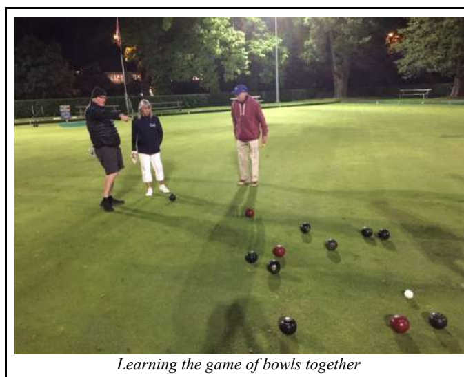
Learning the game of bowls together