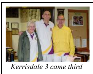
Kerrisdale 3 came third