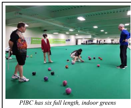
PIBC has six full length, indoor greens

PIBC is located at 4588 Clancy Loranger Way, behind Nat Bailey Stadium and neighbouring Queen Elizabeth Park on the 33 rd Avenue diversion between Main and Cambie streets.