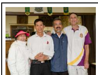
Richmond 6 winners

Richmond dominated the final standings at the 2021 pandemic shortened Elm Park Triples.