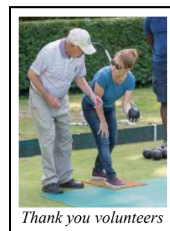
Thank you volunteers