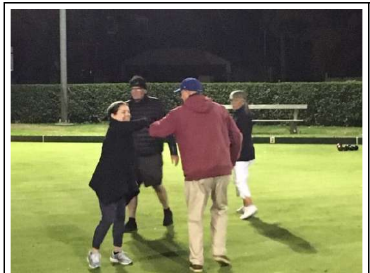
Mixed champs share COVID congratulatory bump