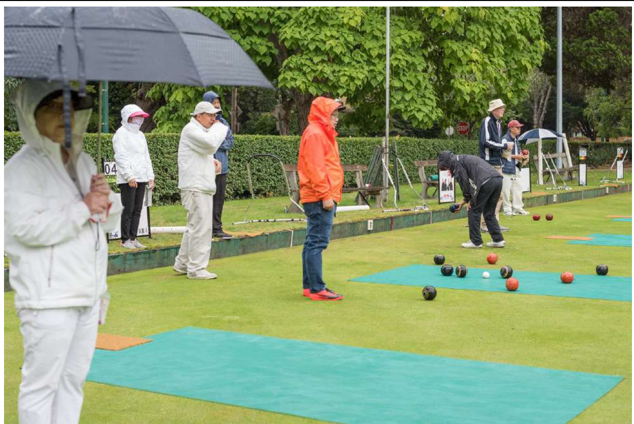
It was a soggy end to an otherwise enjoyable pandemic Elm Park Triples