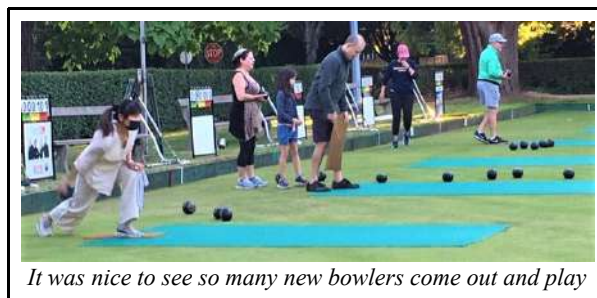
It was nice to see so many new bowlers come out and play

However, that was as good as it got for Kerrisdale. The first-time foursome ran out of gas in their final game, losing by a wide margin to a fifth-place-finishing Stanley Park side.