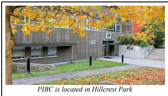
PIBC is located in Hillcrest Park