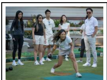
Bowling rentals = fun

This year, the club was fortunate to attract 11 separate groups to date to rent our Elm Park green for a fun day of bowling.