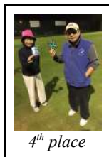
4 th place