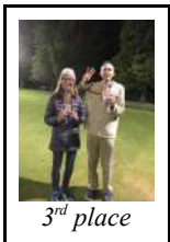
3 rd place