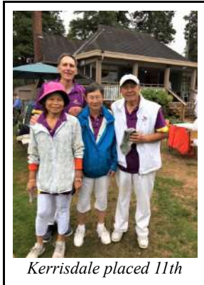
Kerrisdale placed 11th

An unlikely Kerrisdale club foursome made some noise at the Barbara Williams two-bowl fours at West Point Grey to begin the month of September.