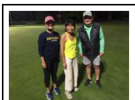
The Top-3 novices

Kerrisdale played host to its first novice championship in more than two decades, and quite likely its very first gender-neutral tournament for first-year bowlers ever.