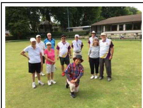
Last year's fun pairs

For a second consecutive season, the newly organized Tuesday morning moneymaker has been forced to cancel it's May start, following COVID-19 restrictions that continue to disallow any inter-club play from taking place.