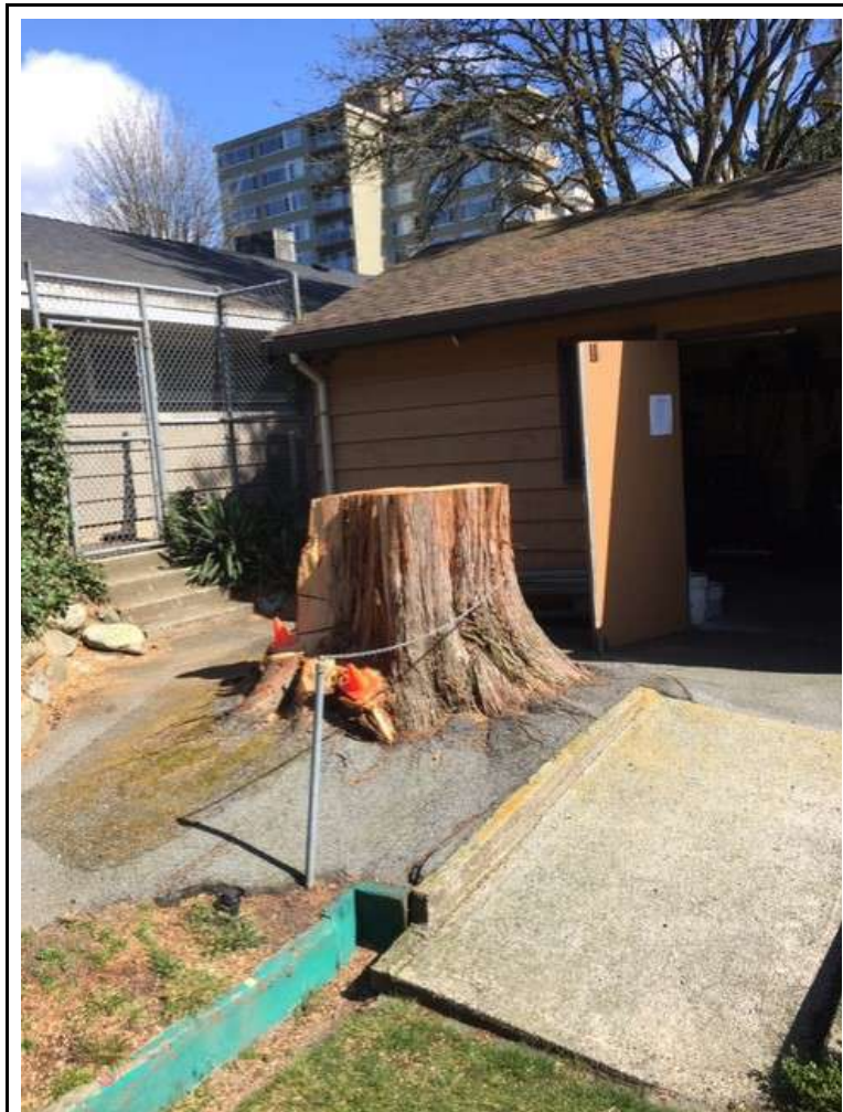
Repairs have been made from the March windstorm

Last year, if you remember, the club hosted an all-day pairs tournament for Kerrisdale members in August that was thoroughly enjoyable.