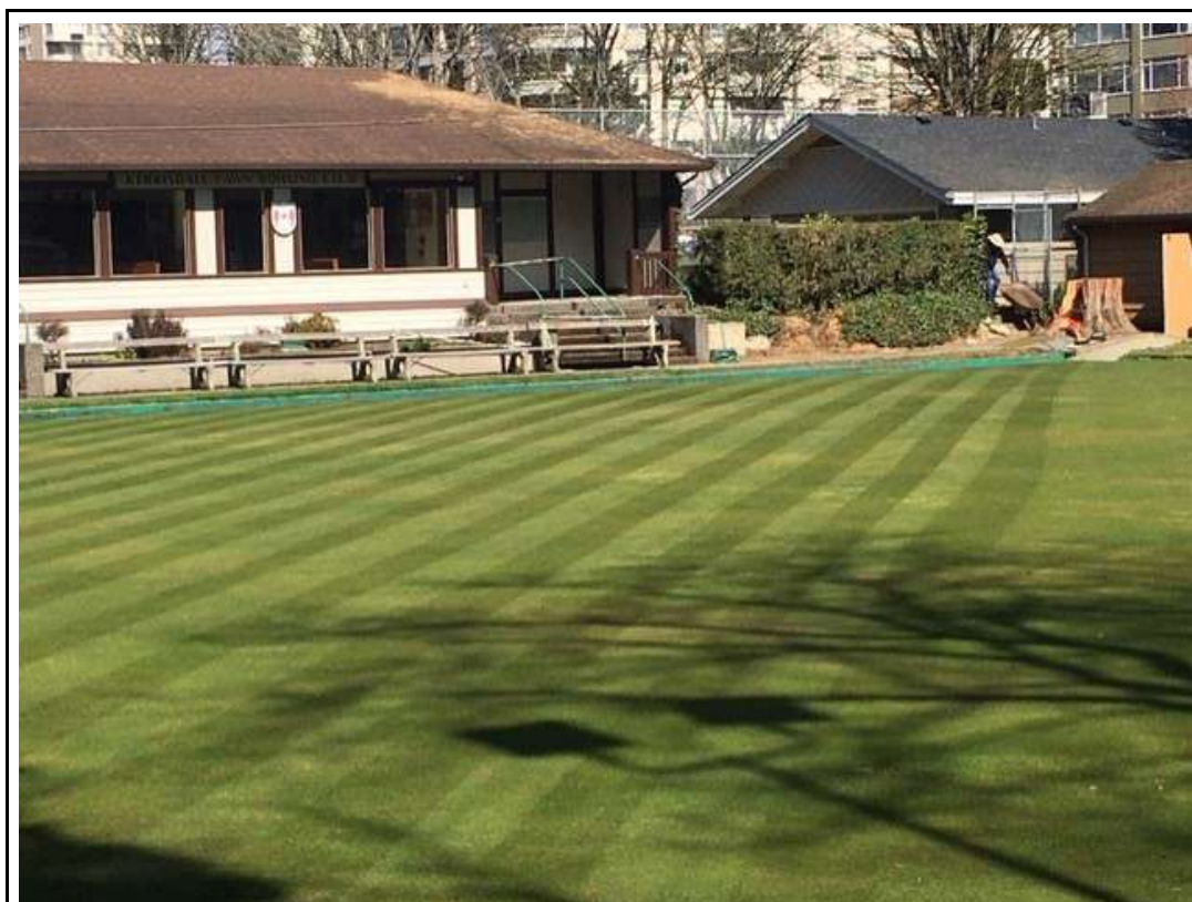
All spruced up and ready for another season of bowls