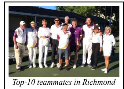
Top-10 teammates in Richmond

Kerrisdale lost all four contests, including singles, pairs, triples and fours by 10 points or more to the juggernaut Richmond side.