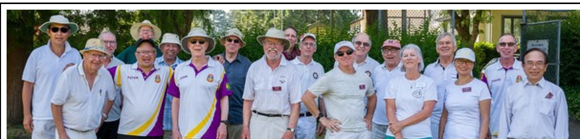
Kerrisdale and Dunbar met again for another installment of the Whisky Bowl.