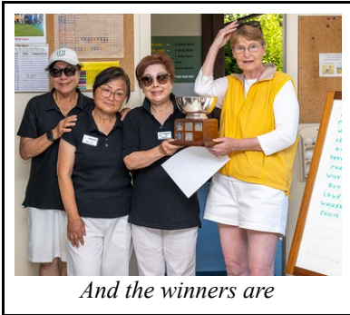
And the winners are

There was more than just hosting at this year's Norine Armstrong women's triples.