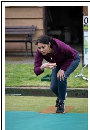
... new club bowlers

Two games, with the first bowler to 15 points, get started this Friday night (Aug. 19) at 7 pm. A tournament draw will take place on the day of at 6:45 pm. Registration cost is a $5.