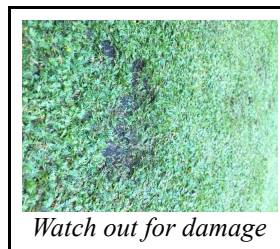
Watch out for damage

Once the top layer of grass is scalped, natural repair takes time and indentations to the surface of the green remain long after, making the