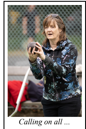
Calling on all ...

All new bowlers are encouraged to come out and test their new-found skills against club peers in a friendly and non-judgemental atmosphere.