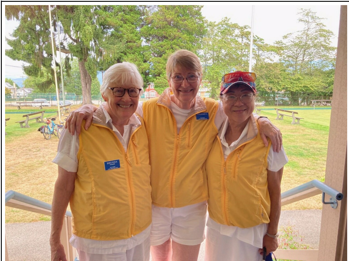
Kerrisdale 1 was No. 1 at the Westside Women's Friday Morning League this season.