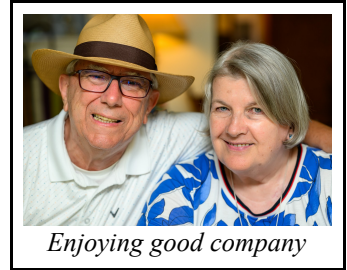
Enjoying good company