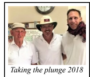
Taking the plunge 2018

Some newcomers have also found themselves bowling on Kerrisdale club teams in our own Tuesday morning triples league, as well as the men's and women's leagues hosted at West Point Grey on Thursday and Friday, respectively.