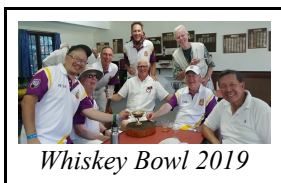
Whiskey Bowl 2019

The tentative date for that annual Whiskey Bowl competition is Wednesday, July 31.