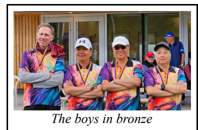
The boys in bronze

The club foursome lost its second game of the tournament on the opening day and had to survive through the loser's bracket, playing in every subsequent draw and winning four straight 16-end games, to earn a spot in the eventual top-3 on the third and final playoff day.