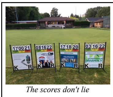
The scores don't lie

Kerrisdale failed to advance in the Vancouver and District Top-10 mixed knockout competition.