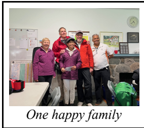
One happy family

It was a family affair for two Kerrisdale LBC members at the Hyack Mixed Triples tournament in New Westminster.