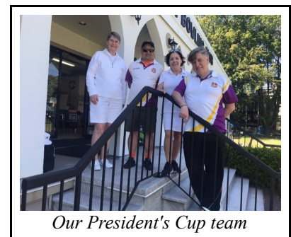
Our President's Cup team

The event is open to V&D bowling club board members only