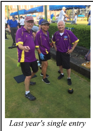
Last year's single entry

Kerrisdale is making a name for itself in Granville Park's Wednesday Evening Triples League.