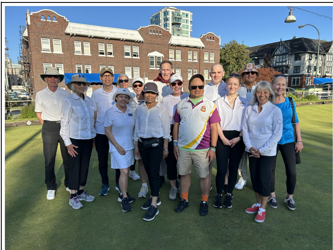
Kerrisdale fielded five teams for the Wednesday Evening Triples League. Well done!