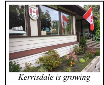
Kerrisdale is growing

Thank you to all the volunteers involved in putting on the spread.